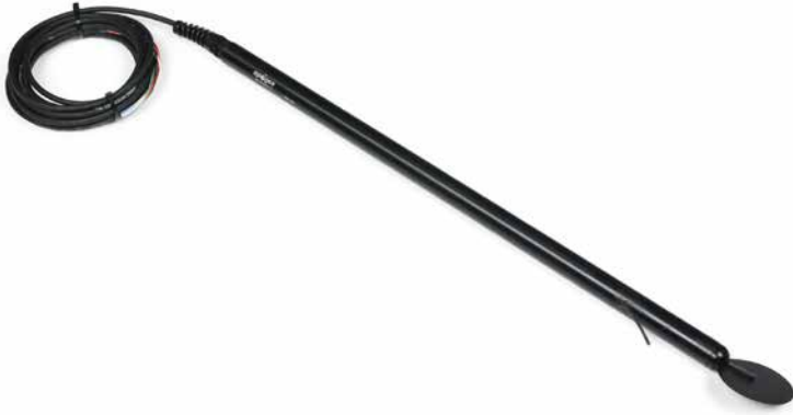
Simulated Leaf and Bud Temperature Compared to Air Temperature